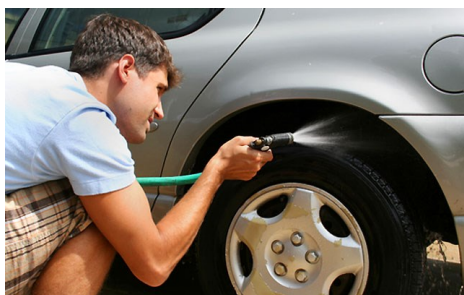
Wash that salt off