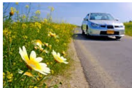
The flowers are coming!

cooling problem is usually fairly inexpensive, even if it involves a trip to the repair shop. On the other hand, engine damage due to a neglected cooling system and regular overheating can be so expensive that you'll consider getting rid of the car altogether.