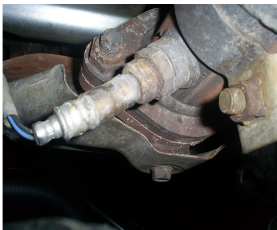
One of the many locations of oxygen sensors in the exhaust

The sensors let them monitor their oxygen consumption and assess their cardiovascular fitness. As automotive manufacturers continue to work to optimize performance and efficiency on the road—your vehicle now contains like themed technology. Every new car on the road comes equipped with oxygen sensors as part of the vehicle's emissions control system.