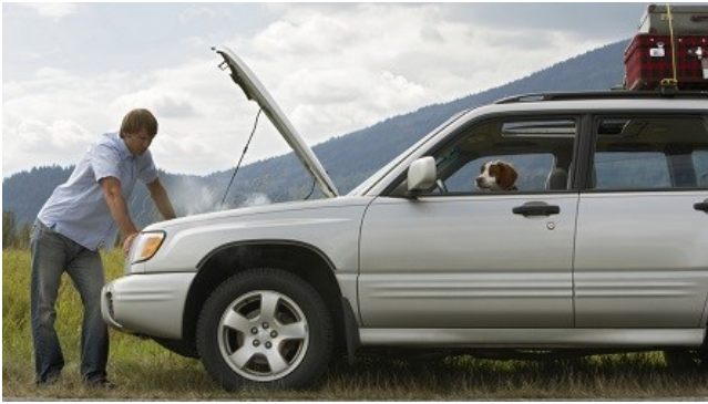
Figure Out Why Your Car is Overheating

It's okay for you to blow off steam from time to time, but your car? Not so much. An overheating engine is more than a bummer, it can be an expensive engine killer that will leave you on the side of the road, then on to the repair shop for a serious repair bill. If your car has been running hot, you know the feeling. You're sitting in traffic, the light turns green, and you pray that traffic breaks enough for you to get some air flowing over the radiator so that the engine temperature needle will go down just a little bit. It's beyond stressful, and there's no reason you should be forced to endure this. The fact is, there are usually a few culprits to look into when your engine is running hot.