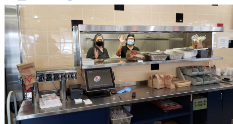
Staff at Salisbury House