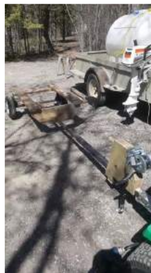
top speed at

These are a sought-after motor due to their top speed and lightweight. This little boat with two people in it moves along just fine and is far more stable than a canoe. The boat is an awkward shape but very easily moveable with two people. My father and I built a custom mini trailer for this boat to make it easier to launch and leave the outboard and gear attached. The trailer looks like a boat trailer you would normally see, only... Mini. It attaches to my ATV and