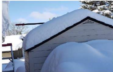
Shed covered in snow again