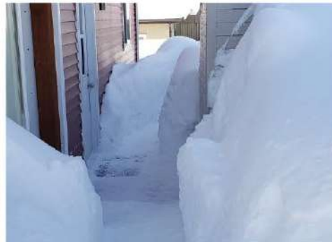
Snow tunnel to our back door

When you see how much snow has to melt, it kind of makes you wonder how spring/summer will ever get here.