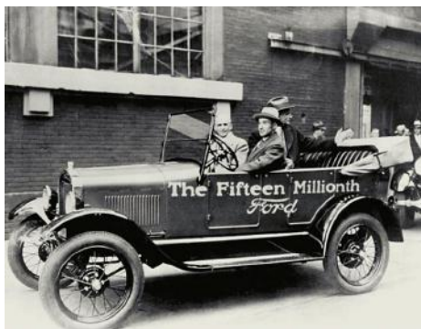
The advent of the electric starter on cars like Ford's Model T sounded the death-knell for EV sales in the early 20th century.

In 1908, Thomas Edison offered a solution to difficult and dangerous battery maintenance with his nickel-iron Storage Battery that required no maintenance. However, with a lifespan of only up to 4 years, this was a very expensive solution. This battery drove up the price of a new EV and every four years you had to replace the battery at a cost equal to buying a new Ford Model T. Yes, a battery for the price of an entire car.